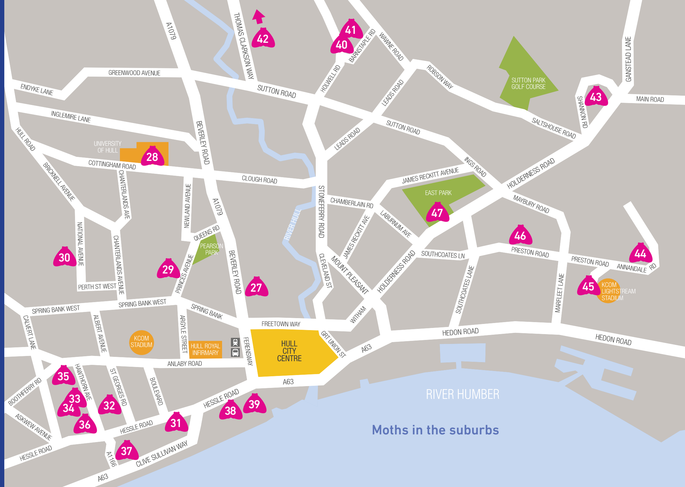
Moths in the suburbs